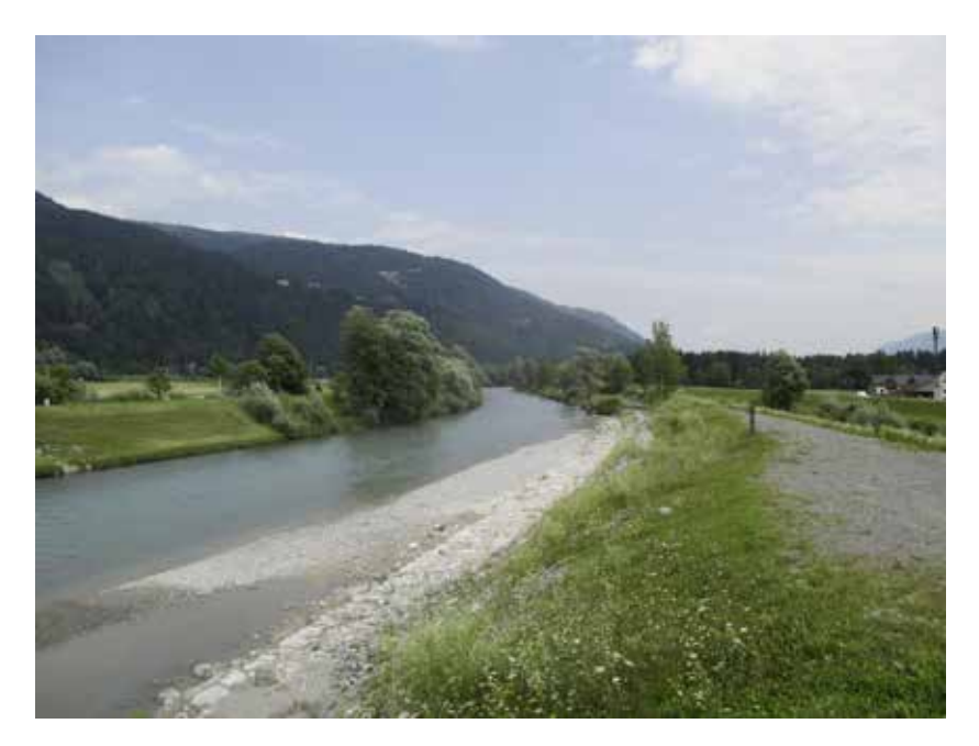
Fig. 2: River Gail, domesticated by dams in its wide valley bottom

Another example for highlighting a striking aspect of a geographical feature is Reifnitz , the German name of a village at the southern banks of Lake Woerth [Wörthersee] also in Carinthia (see Fig. 3). This village name has been derived from a little river (rather a brook) running into the lake there. Both names are linguistically derived from Slavic Ribnica , which means 'fish brook' (Pohl 2020: 173). It has to be mentioned that this area had a Slavic population before it was colonized by Bavarian German-speakers. The latter assumed the name they found and adapted it to their own language. Naming it 'fish brook' had obviously been motivated by the fact that fish (chars) use to go up this brook for spawning. It is the brook along the lake where this phenomenon is the most impressive up to the present day.