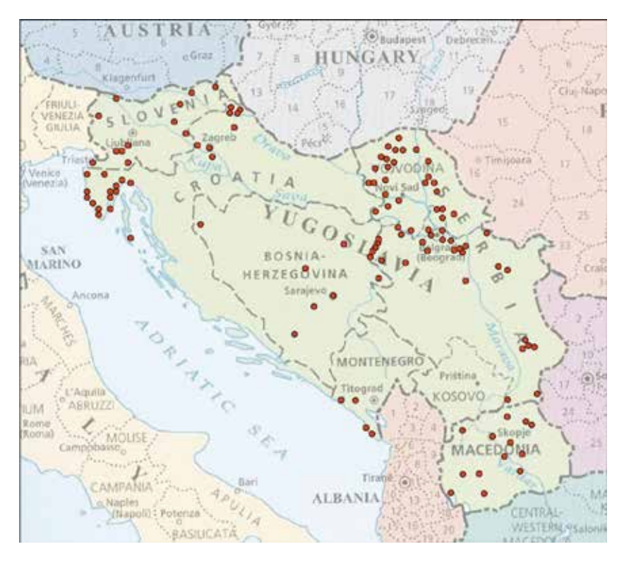
Fig. 6: Current intra-urban place names after Tito (Sources: Google Earth, city/town plans; thematic content by the author, base map Magocsi 1993, 47)

The distribution as it appears in Figure 6 corresponds of course to some extent to the disparity of towns/cities in former Yugoslavia. Smaller settlements usually practice no street naming and ex-Yugoslavia had a 'central periphery' with a low urban density in the centre.