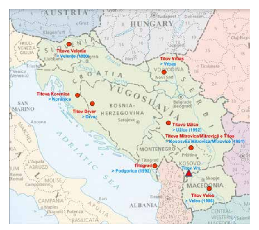
Fig. 5: Changes of town/city names and a still existing mountain name after Tito, Titov Vrv (Macedonian!) in the Šar Planina (Thematic content by the author, base map Magocsi 1993, 47)

In the successor states of Yugoslavia, e.g., all names of cities and towns named after Tito, the prestigious, but ambivalent leader of Communist Yugoslavia, have been removed (see Fig. 5), while many names of (main) streets and squares after him are still in place (see Fig. 6). This allows conclusions at the political and cultural disposition of the local communities and could be analysed in various directions.