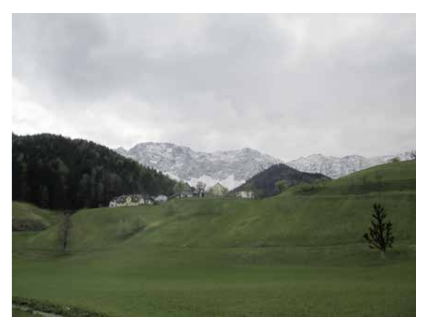
Fig. 1: Northern rock faces of the Koschuta/Košuta in the central part of the Karawanken/Karavanke

Also some mountain names result from onymisation. An example is Tauern , derived from pre-Roman *taur- 'mountain, pass' (Pohl 2011: 17, Pohl/Schwaner 2007: 218). In contrast, the name Karawanken/Karavanke from pre-Celtic *kar- 'rock, stone' (Pohl/Schwaner 2007: 212) describes a specific of this mountain range that exposes striking rock faces especially to the North (see Fig. 1).